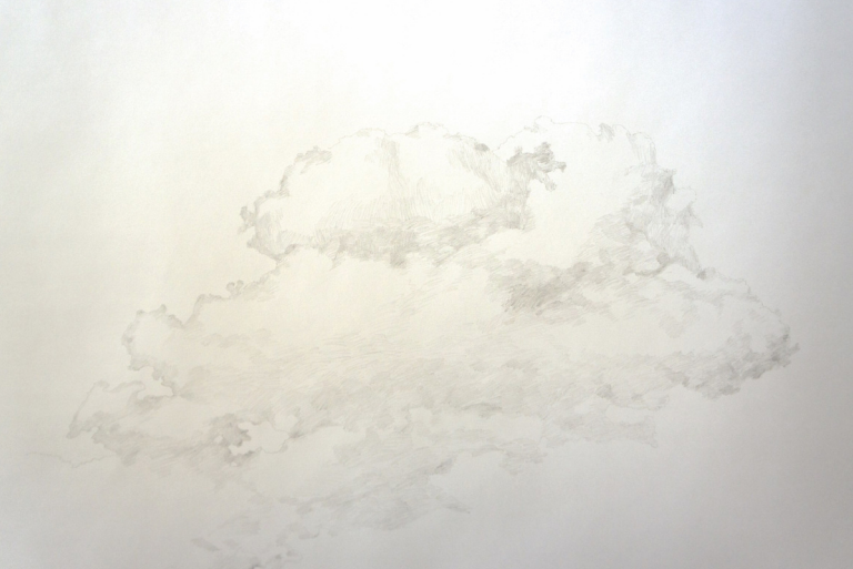
Clouds, 2016, Graphite on paper