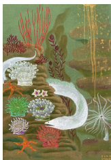
January 2022 Yuko Yabuki Tempe